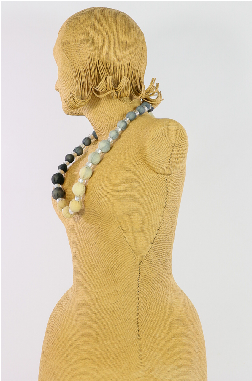
Organic wool necklace