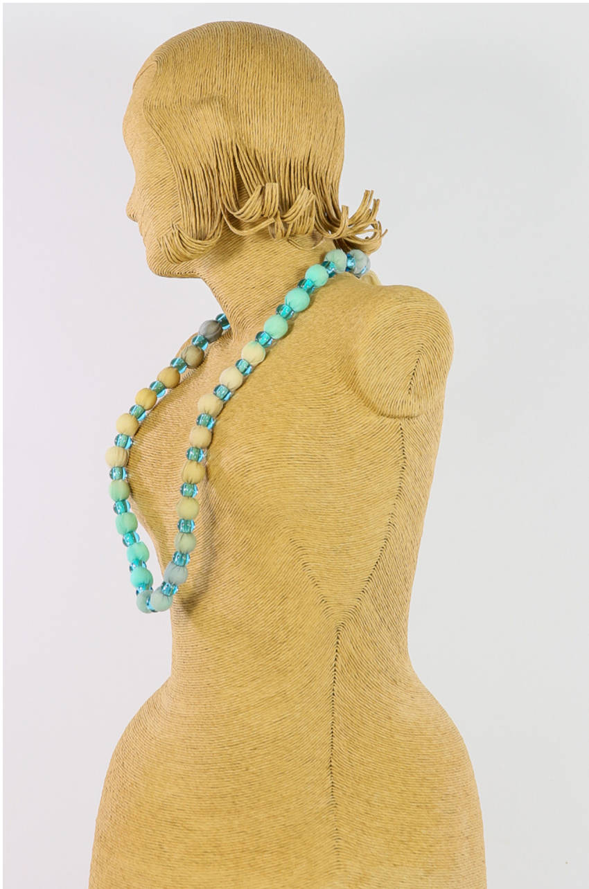
Collana lana bio