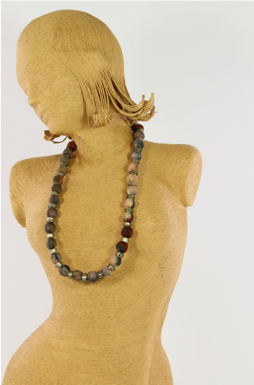
Collana lana bio