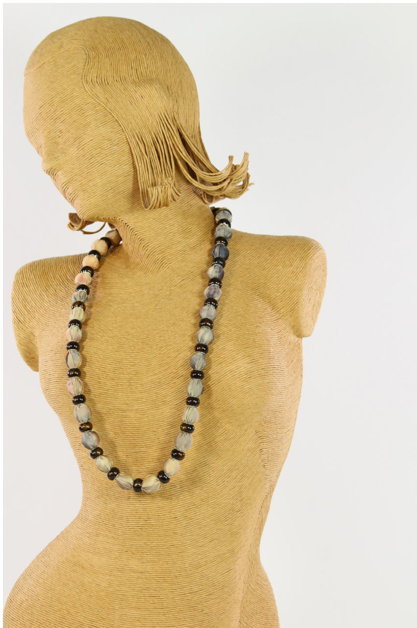
Collana seta della pace