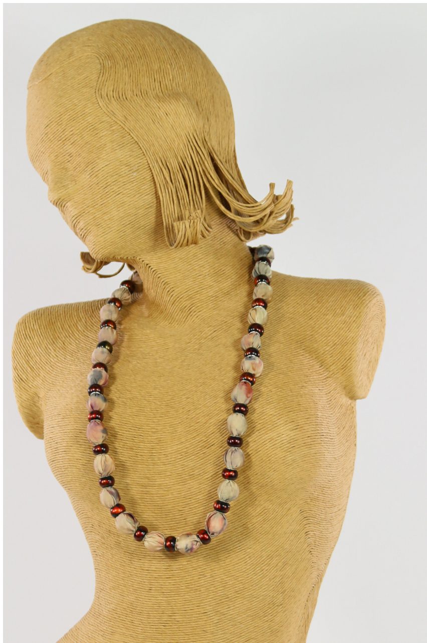
Collana seta della pace