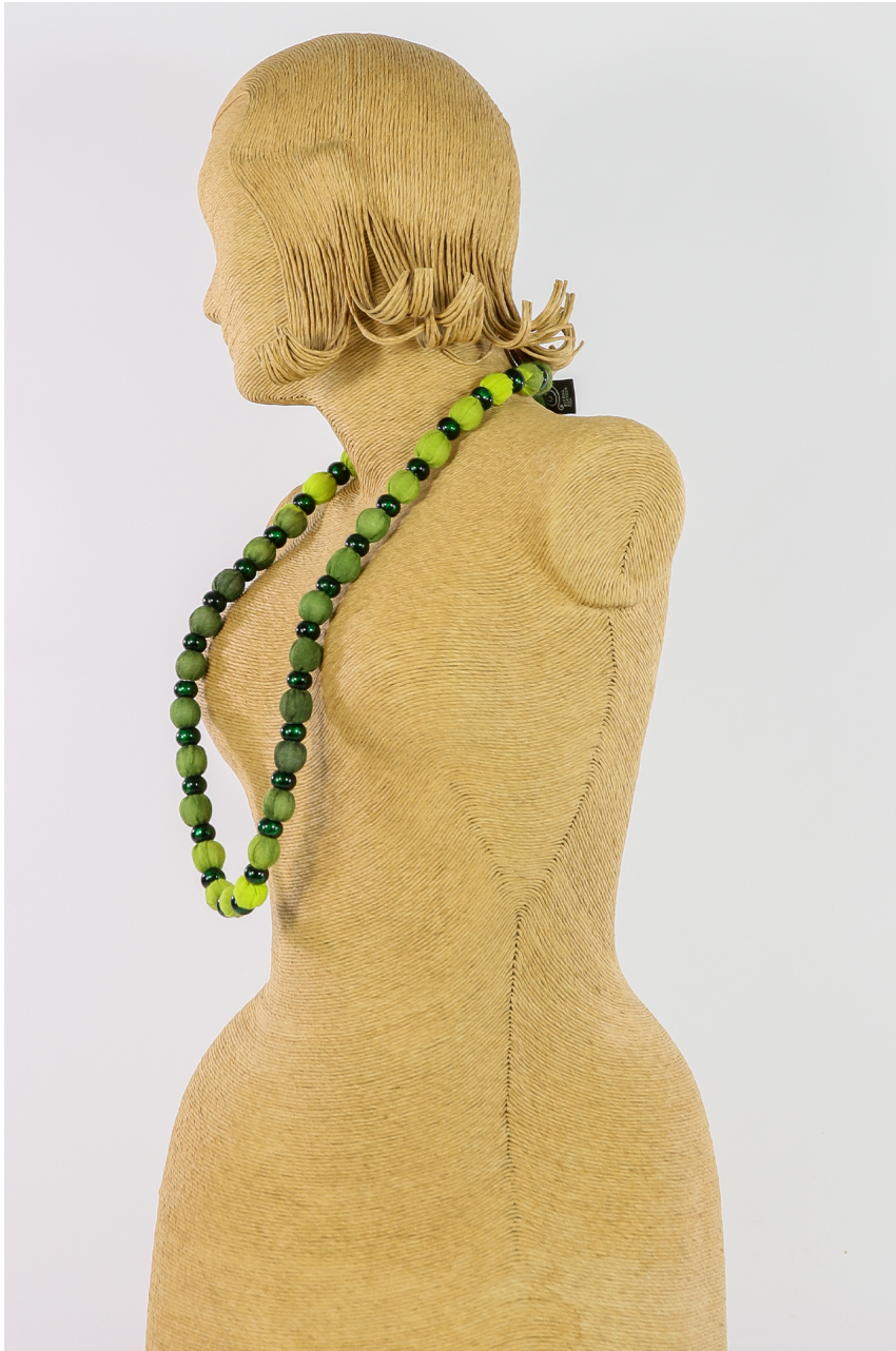
Collana lana bio