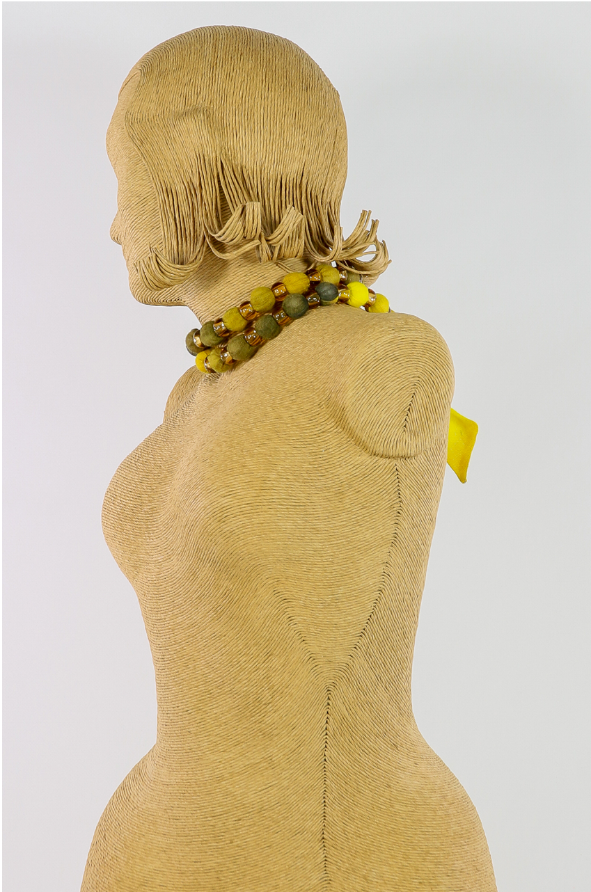
Collana lana bio